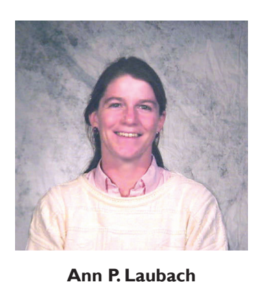
B.A. Government Oberlin College