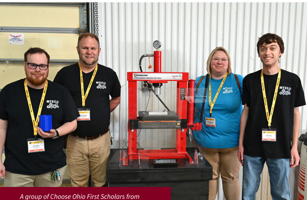
A group of Choose Ohio First Scholars from Marion Technical College