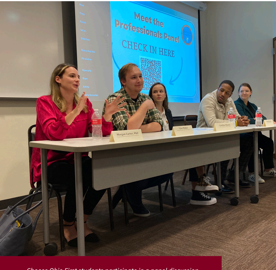
Choose Ohio First students participate in a panel discussion.

These support systems are designed to increase retention and graduation rates for Choose Ohio First Scholars. Many colleges and universities also offer career and post-graduation advising, helping to connect Choose Ohio First graduates with Ohio employers.