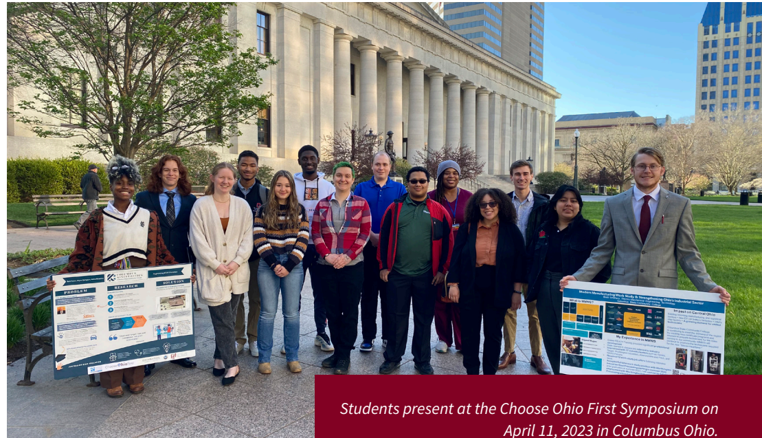
Students present at the Choose Ohio First Symposium on April 11, 2023 in Columbus Ohio.

The Chancellor awarded a Choose Ohio First designation and $28 million to 45 Ohio institutions, which began offering scholarships from the FY23 funding round in AY24. Grantees will receive funding on a reimbursement basis as Choose Ohio First Scholars successfully progress through their academic program.