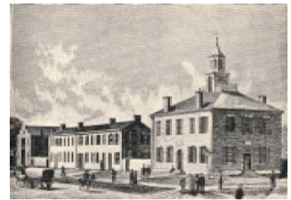
Third State Capitol Columbus