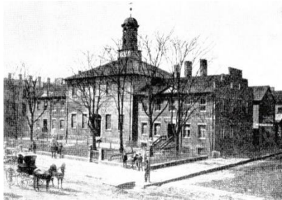
Second State Capitol Zanesville