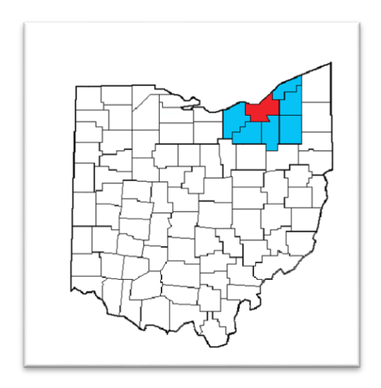
Figure 2: Map<sup>6</sup>

As illustrated in Figure 1.2, under USEPA's current eight-hour ozone standard and Ohio's state implementation plan, only the Cleveland-Akron area is required to implement E-Check. That area includes Cuyahoga, Geauga, Lake, Lorain, Medina, Portage, and Summit counties.