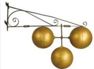
Traditional Pawnbroker's Sign 7

Ohio law defines a " pawnbroker " as a person engaged in the business of lending money on deposit or pledges of personal property at a total charge, rate of interest, etc., of more than 8% per year (0.67% per month). The pledged personal property cannot be a security, printed evidence of indebtedness, title, deed, or bill of sale. The law requires anyone acting as a pawnbroker to obtain a license, and also sets strict limits and requirements on pawn loans, regulating interest, fees, notices of default, and recordkeeping. 6