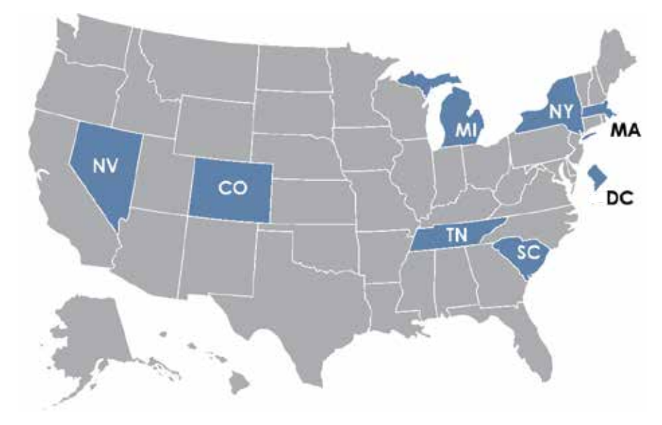
Figure ES 1.7. Case study states